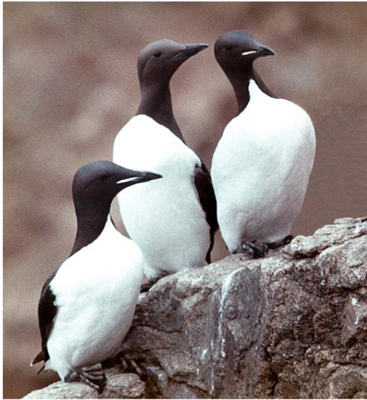
Common (center) and Thick-billed Murres

Geological Survey Biological Resources Division (USGS-BRD), and the National Institute of Standards and Technology (NIST) initiated a joint effort to develop and test protocols for collecting, processing, transporting, and storing seabird eggs collected at several AMNWR colonies. Based on this preliminary work, the 100-year-long Seabird Tissue Archival and Monitoring Project (STAMP) was designed and implemented in 1999 (see York et al. 2001). This long-term, cooperative project is currently collecting, processing, and cryogenically storing common and thick-billed murre and black-legged kittiwake eggs from nine AMNWR and three privately owned seabird colonies at the NIST National Biomonitoring Specimen Bank (NBSB) for current and future studies of pollutants, and it is also analyzing subsamples of the banked eggs to establish baseline levels for persistent bioaccumulative contaminants (e.g., chlorinated pesticides, PCBs, mercury) at these Alaskan nesting locations. 2