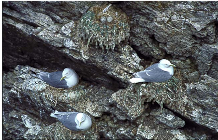
Black-legged Kittiwakes on Nests incubating Eggs (a typical 2-egg clutch can be seen at top-center)